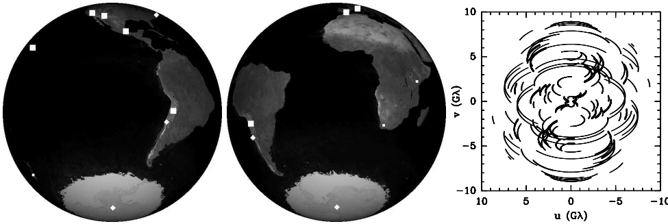
Figure 2. Left two panels: Current and future millimeter VLBI arrays. Large squares show telescopes that exist or are under construction. Medium diamonds show existing telescopes that could be refitted for VLBI. Small squares show other potential sites. Right: The (u, v) coverage produced by these arrays at 230 GHz. The bold curves show the coverage obtainable from the 7-telescope array described in the text. The curves in normal weight show the additional coverage that would be provided by the 13-station Event Horizon Telescope. High-fidelity imaging requires minimizing the gaps in (u, v) coverage.